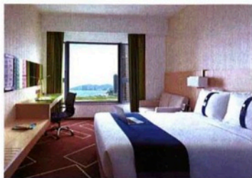
This pag from tope: Crowne Plaza Superior Room Double and Holiday Inn Express Standard Seaview Room